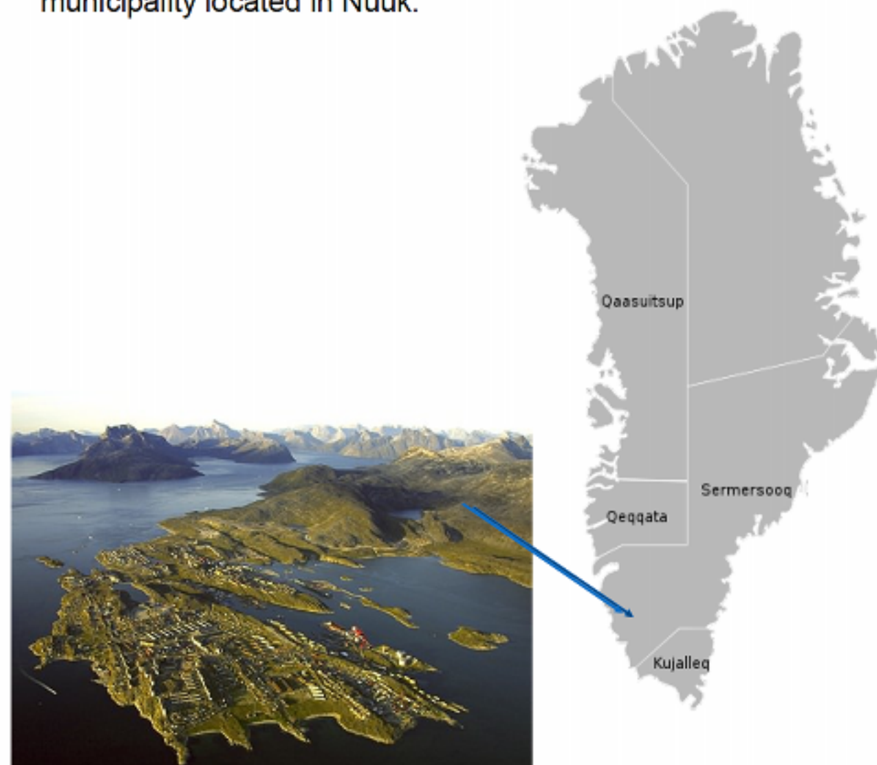
Nuuk Capital of Greenland

The focus of a newly started ph.d.-project (start 01.01.2011 end 31.12.2013) is on the professional knowledge and the personal knowledge among social workers whom are working with marginalized children and their families in the welfare department in Sermersooq Kommune, Greenland's biggest municipality located in Nuuk.